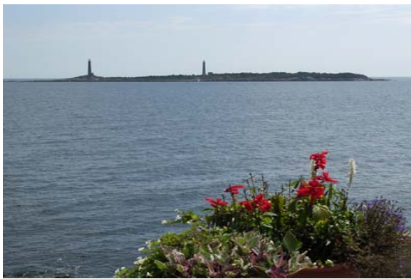
(View of Thacher Island from the open porch and brick patio)

Eden Pines Inn is an oceanfront paradise, perched along the granite coast of Rockport, Massachusetts. Beautiful sandy beaches are but a short walk away and charming Rockport center, with its popular Bearskin Neck, is a few minutes by car.