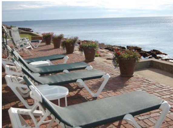
(View of brick patio)

From the front porch, guests can watch lobstermen tending their traps, fishermen working their craft and sailboats heeling in the wind - all against the background of Thacher Island with its historic twin lighthouses.