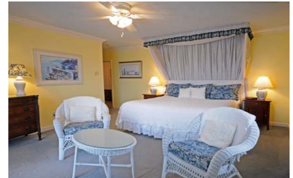
(Lightning Suite - Room #2)

The Inn's bedrooms offer panoramic views of the ocean and most have private balconies to enjoy the seaside air. All rooms have elegant private bathrooms, sitting areas and air conditioning.