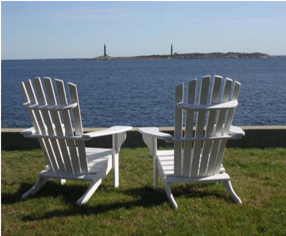
(Looking toward the twin lighthouses of Thatcher Island)