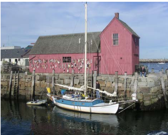
(Motif #1 in Rockport Harbor)

We are located directly on the ocean in historic Rockport - an old fishing village filled with shops of every description and enhanced by its deserved reputation as one of the leading art colonies in New England.