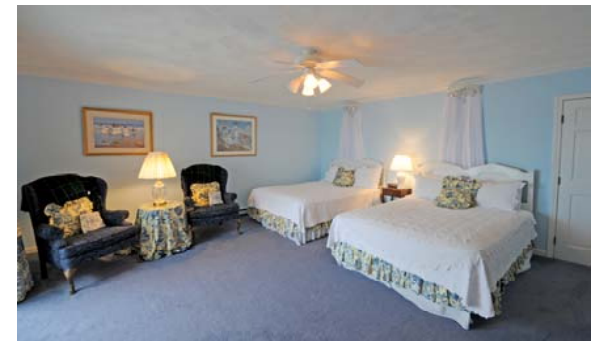
(Sloop Suite - Room #4)

The Inn's bedrooms offer panoramic views of the ocean and most have private balconies to enjoy the seaside air. All rooms have elegant private bathrooms, sitting areas and air conditioning.