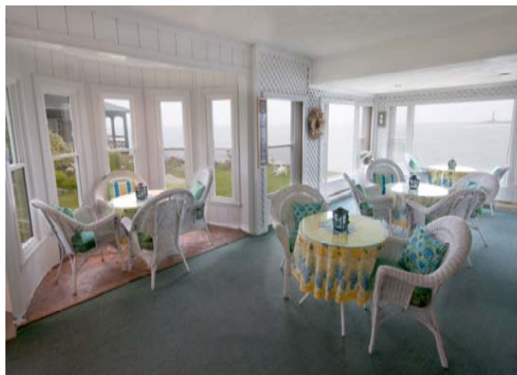
(Sun-filled breakfast room)

Eden Pines Inn offers its guests a complimentary continental breakfast, afternoon cookies, and evening cheese and crackers. In the evening, enjoy a cool breeze on the porch with a unique view of the moon as it rises on the water in front of you.