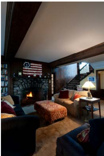
(Living room with stone fireplace)

Eden Pines Inn is an oceanfront paradise, perched along the granite coast of Rockport, Massachusetts. Beautiful sandy beaches are but a short walk away and charming Rockport center, with its popular Bearskin Neck, is a few minutes by car.